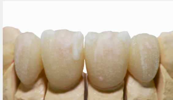
Individualization with Opal Effect 1, Dentin A3 and Mamelon light.