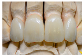
Crowns after stain and glaze firing.