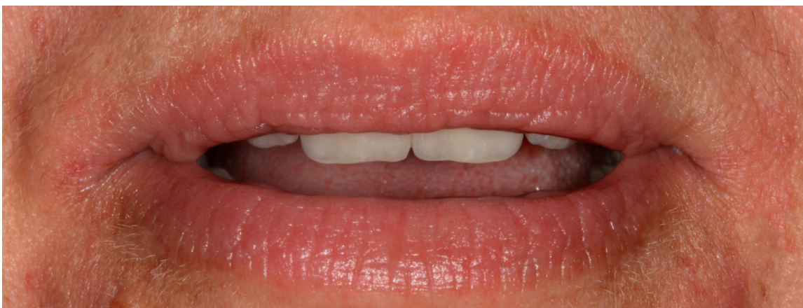
The final result fits naturally into the surrounding oral cavity.