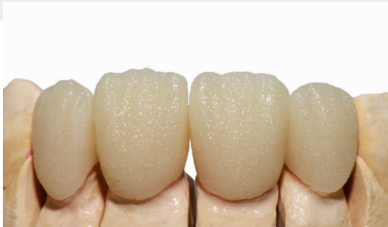
Wash firing with Transpa clear, "sprinkle technique". Ceramic used: IPS e.max Ceram, Co. Ivoclar.