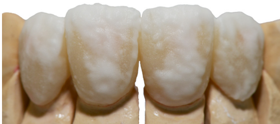
Incisal build-up with Transpa Incisal 2.