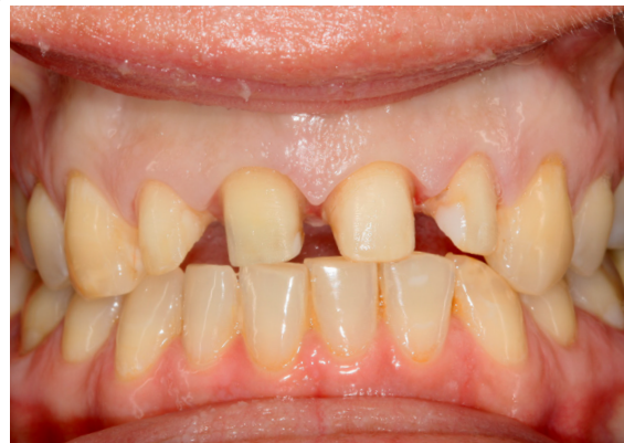
After crown preparation of tooth 12 - 22.