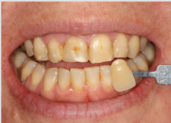
Heavily discolored and deformed anterior teeth. Patient's request: masking of the anterior teeth with crowns.