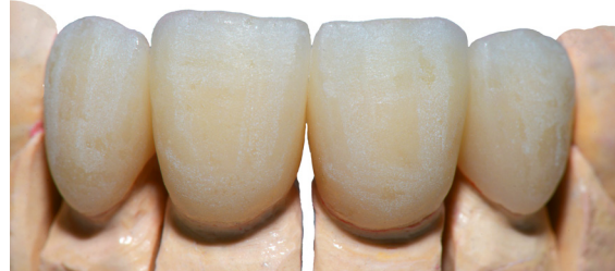
Elaboration of the shape and surface structure.