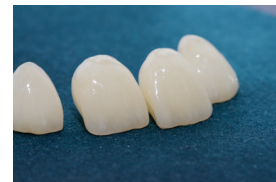
Finished crowns, ready for cementing.