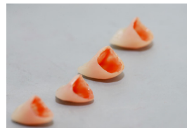
Etching with HF gel.