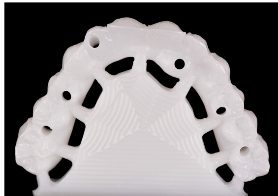
Production of the zirconia framework for the upper and lower jaw from NexxZr+ white.