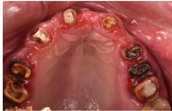
After removing the restoration in the upper jaw.