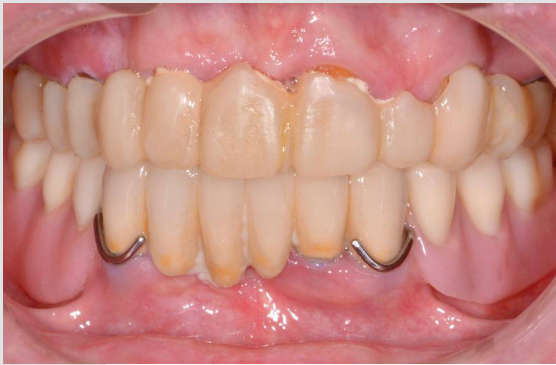
Initial situation of the patient.

Initial situation & framework fabrication