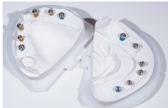
Implantation of 6 implants each in the upper and lower jaw, followed up by model obtaining.