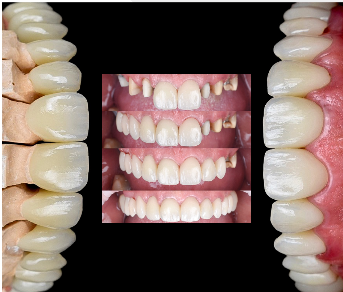
Finished monolithic restorations after staining and glazing on the model and after cementation in the mouth.