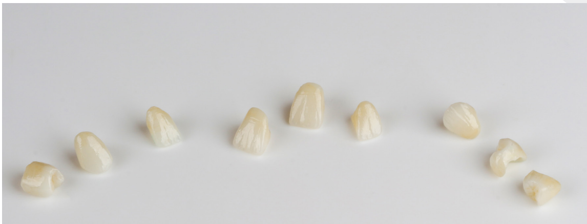
Finished NexxZr T Multi crowns.