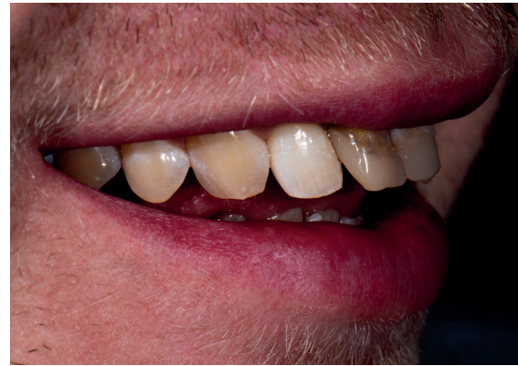
Patient's request: Masking of anterior teeth 11 and 21 with crowns.

Color determination with eLAB (Co. Emulation S.Hein)