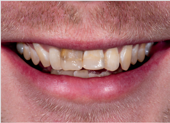
Heavily discolored and deformed anterior teeth 11 and 21.