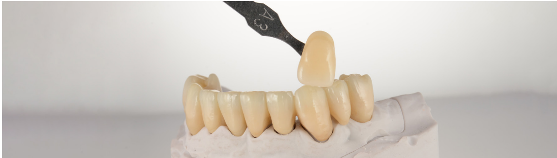
Optimal color match to the A-D shade guide.