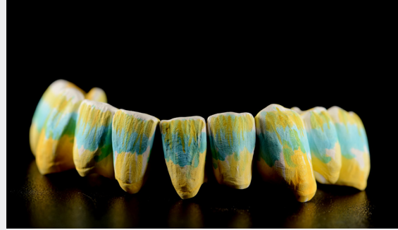
Indication of the mamelon structure with NexxZr Effect Coloring Liquid Brown.