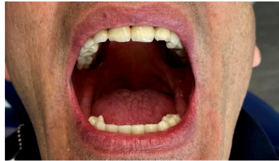
Excellent integration into the surrounding oral cavity.