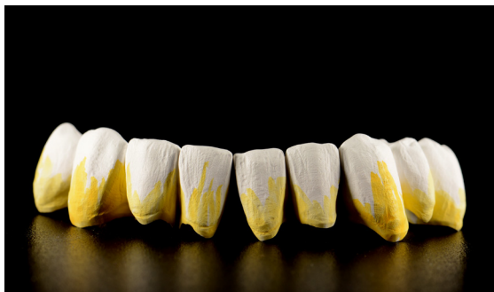
Slightly intensify the marginal area with NexxZr T Coloring Liquid A2.