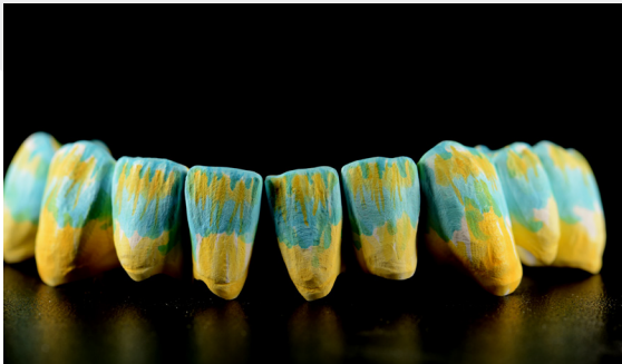
Coloring of the incisal edge with NexxZr Effect Coloring Liquid Grey.