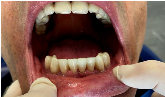
Restorations after cementation.