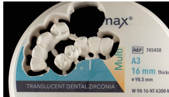
Milled restorations from NexxZr T Multi A3.