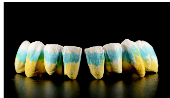
Homogenize the transition area between dentin and incisal with NexxZr Effect Coloring Liquid Incisal Enhancer.