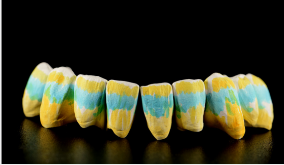
Slight increase in chroma in the incisal area with NexxZr T Coloring Liquid A1.