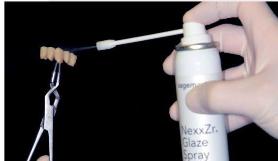
Glaze with NexxZr Glaze Spray.