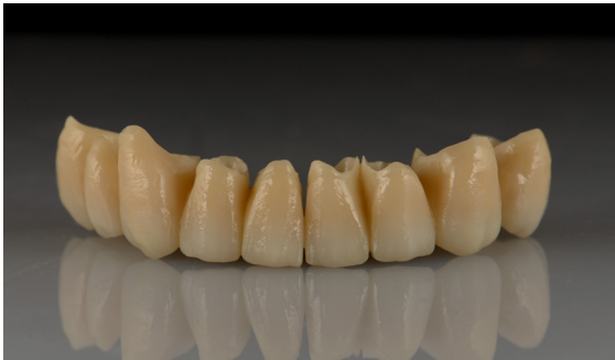
Optical appearance after sintering.