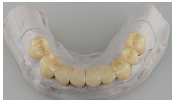
Homogeneous uniform surface gloss on the entire restoration.