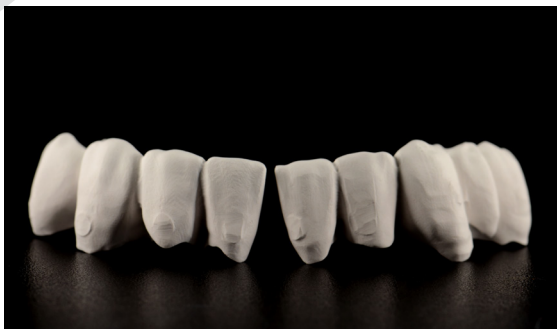
Separation and rough grinding.