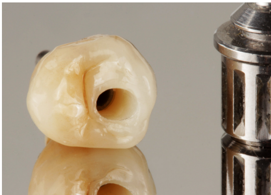
Finished restoration, ready for insertion.