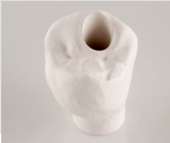
Fabrication of the NexxZr T Multi restoration.