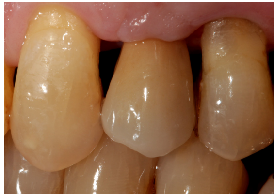
Esthetic outcome in the oral cavity.