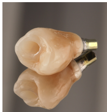
Finished bonded restoration.