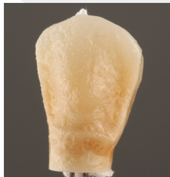
Result after wash firing.