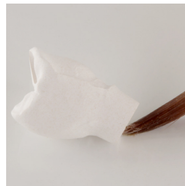
Apply LightBlock liquid to the inside of the restoration.