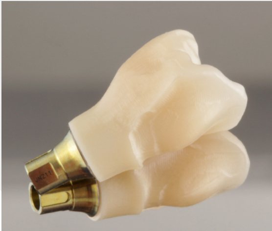
Restoration after sintering.