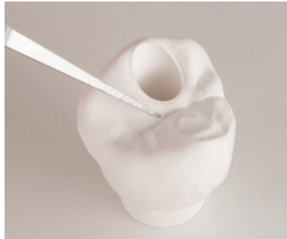
Manual finishing of the fissures with a square burr.