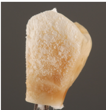
Internal staining and wash firing using "sprinkle technique".