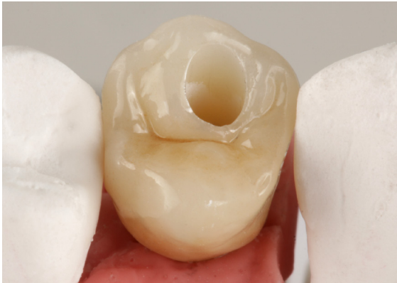
Finished restoration from occlusal.