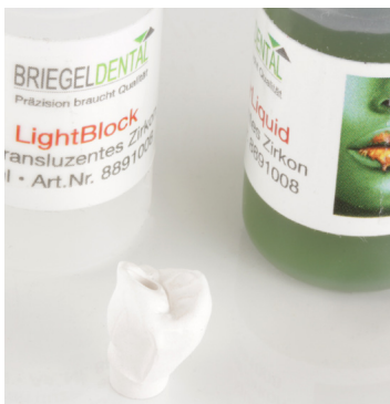
BriegelDental's opaquer liquid LightBlock is used to opacify the zirconium oxide at the bonding face.