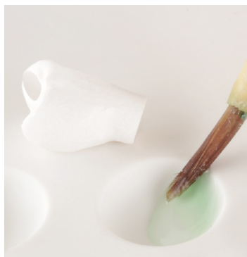
Shake liquid and activator and mix in equal parts, ratio 1:1.