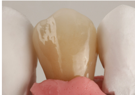
Finished restoration from vestibular.