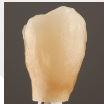
Finished facial layering with ZI-CT from Creation.