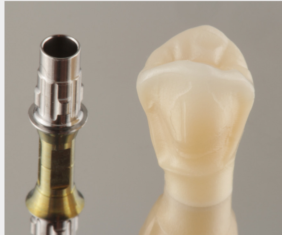
Perfect sintering result. Excellent fit. Outstanding shade and translucency gradient.