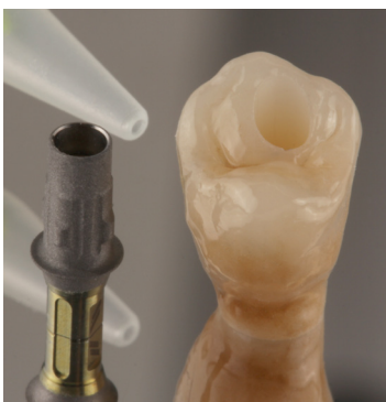
Bonding between restoration and titanium base with Multilink Hybrid Abutment from Ivoclar.