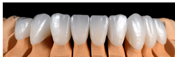
The same process is carried out for the lower jaw restorations.