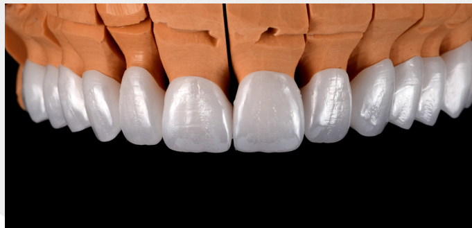
Polishing of all concave and convex surfaces with NexxZr Shine polishers. The texture remains present and visible.