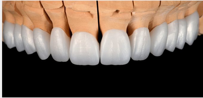
Crowns with preserved texture and surface after sintering.