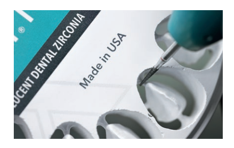
Effortless separation and very good machinability