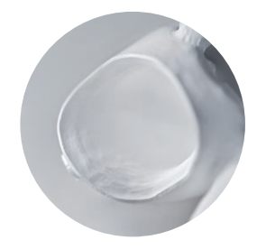
Excellent milling results and sharp edges