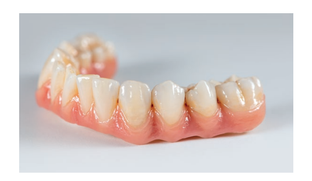
Esthetic results with maximum range of indications